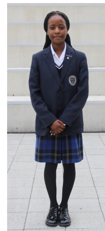
Changes to uniform: Year 9, 2019-20

White shirts, navy blue jumper with white stripe. The navy blue Blazer and plaid skirt which all students must wear, remains the same.